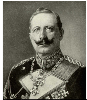
Kaiser Wilhelm II

Your task is to choose one of these two men and research at least four interesting facts about him. These facts might pertain to him personally, his accomplishments, or his fate after the war. Resources for this assignment might include your school library or the Internet.