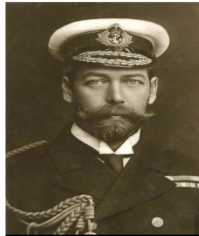
King George V

Great Britain and Germany were two of the main countries involved in the Great War (World War I – 1914-1918). At that time both nations were ruled by kings. Great Britain by King George V (Queen Elizabeth’s grandfather) and Germany by Kaiser Wilhelm II. Interestingly, these two kings were cousins! (A third cousin was the ruler of Russia at this time.)